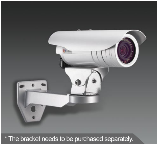
* The bracket needs to be purchased separately.