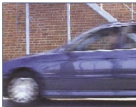
Interlaced, 20 ms difference between odd and even lines