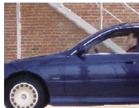
Progressive Scan, all lines are captured at the same time

Progressive scan is used instead of the interlaced method found in analog CCTV (PAL/NTSC) cameras. With progressive scan all pixels (lines) are captured at the same time, enabling moving images to be presented without distortion.